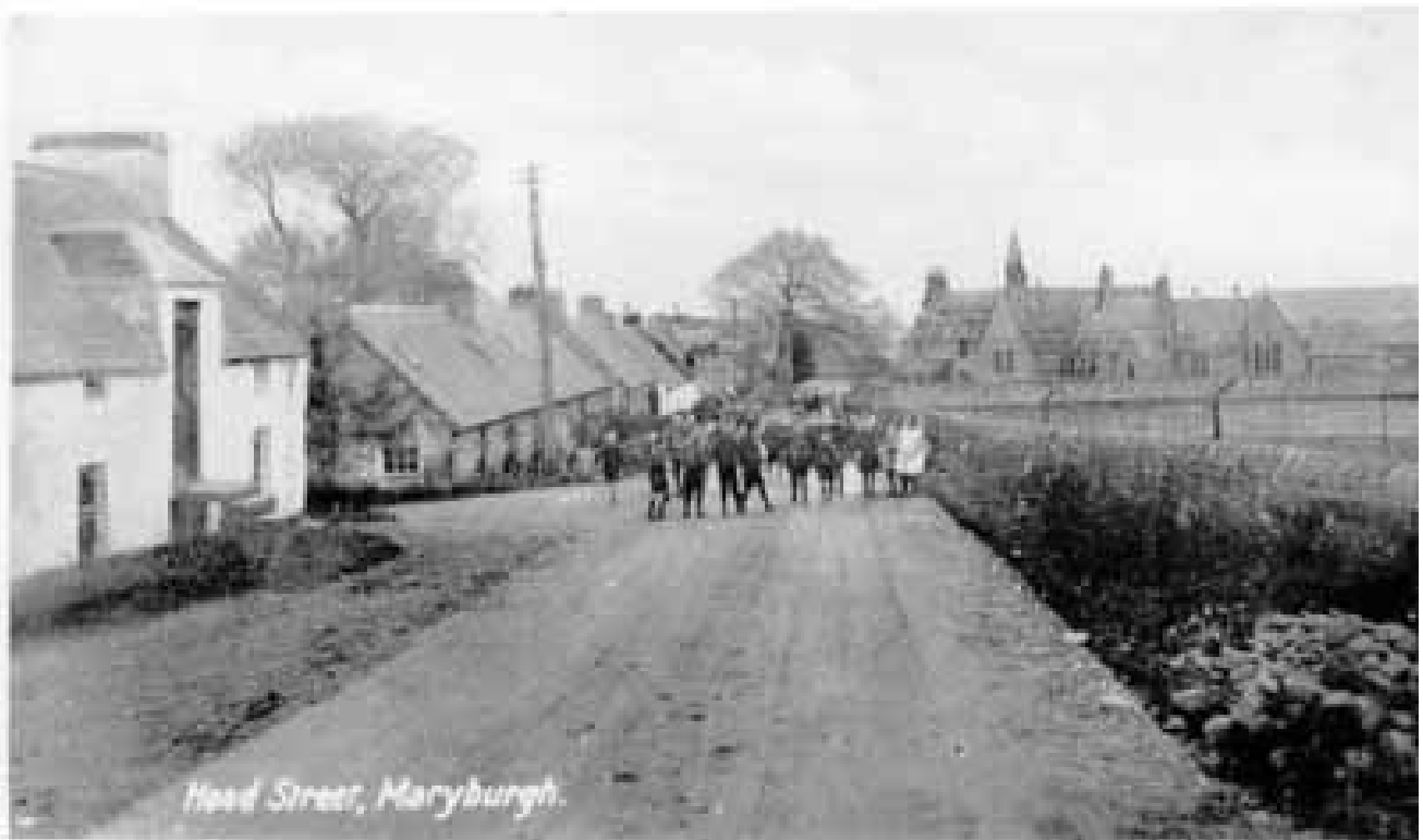
Head Street, Maryburgh.