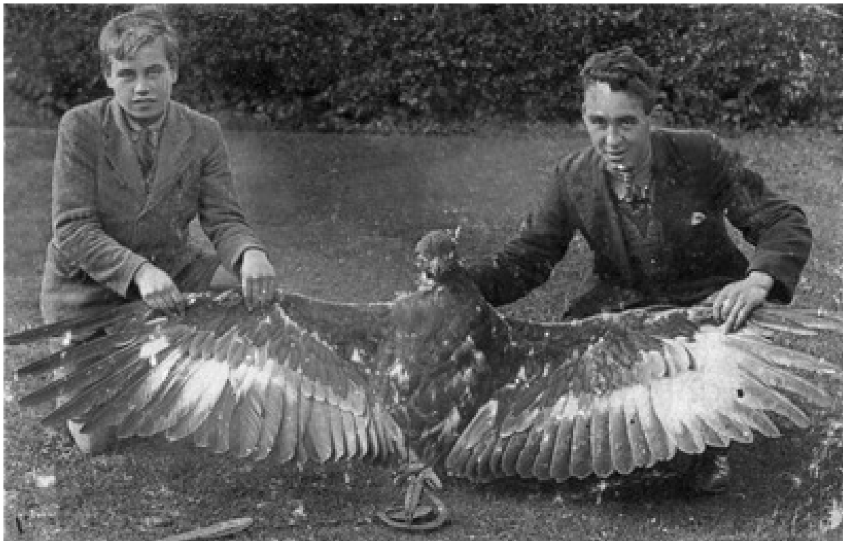
Extract from school log - 1934 Oct 5 A lesson was given to the whole school today on the Golden Eagle which was killed on Knockfarrel yesterday.