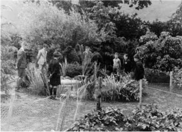
These two photographs possibly refer to the following entry from the school log. - 1933 Oct 17 A lily pond in the School Garden was completed this week.