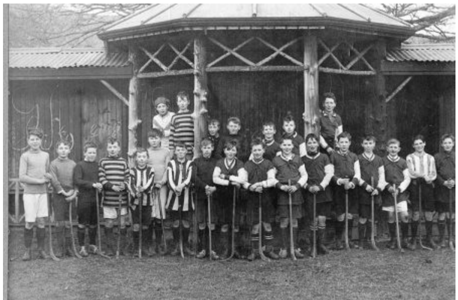
Caberfeidh Shinty Team